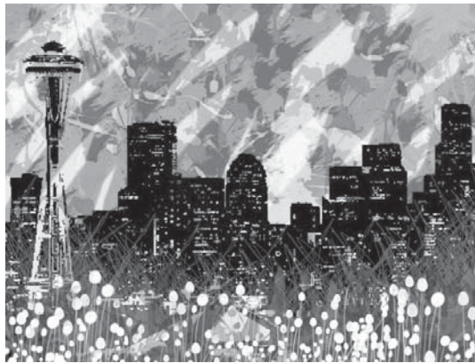
Purple Ribbon – $1,000 Scholarship Award Erin Chuang Landscape

This January, District 212 art students exhibited their work at two prestigious area art fairs. Once again they confirmed that the visual arts flourish at Leyden.